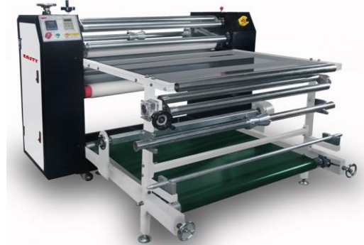
EST-1221 H (upgraded conveyor & air expansion shaft)

EST is designed to meet basic needs, which fully capable for various quality roll & pieces jobs.